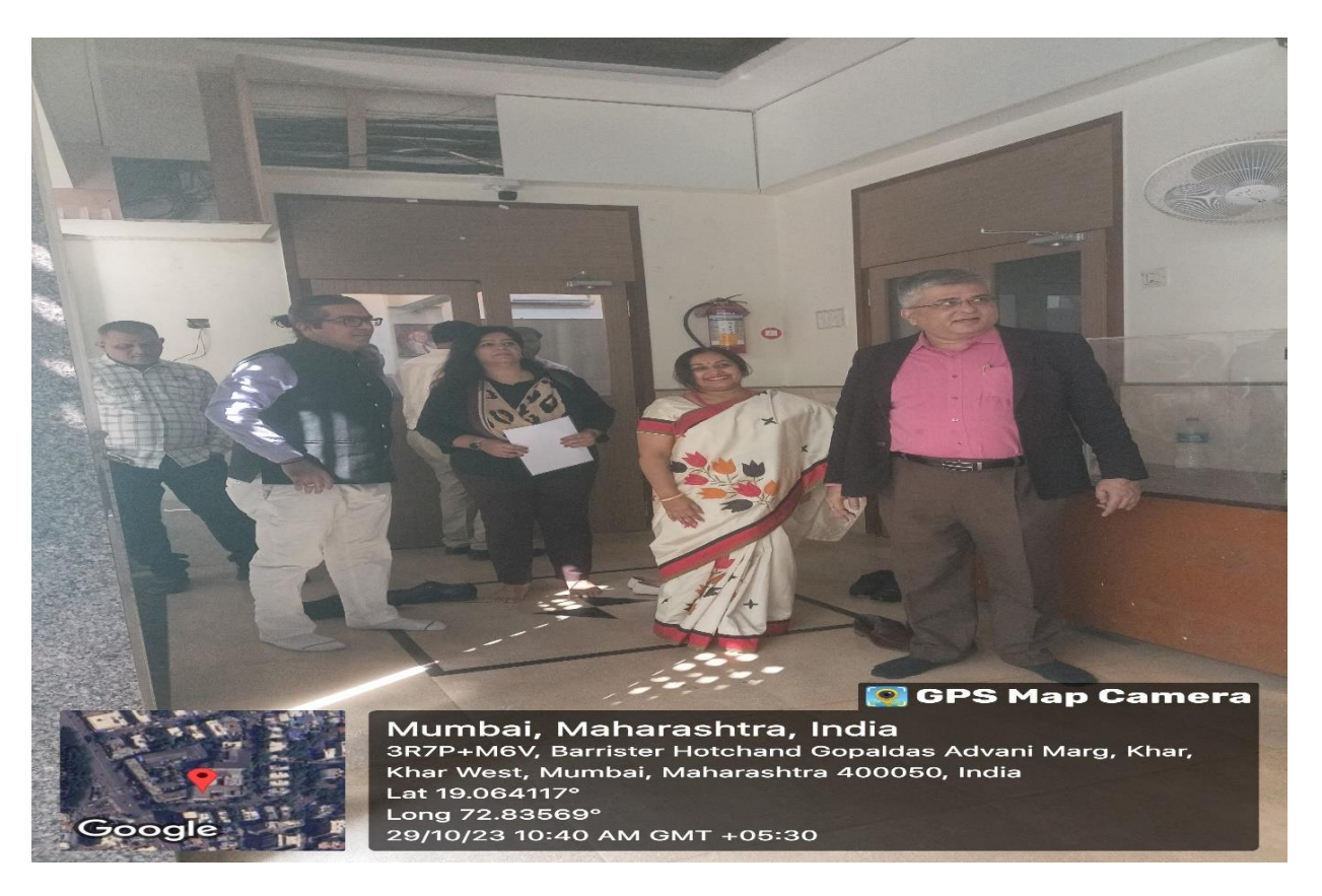
Visit to Computer center and Campus Tour