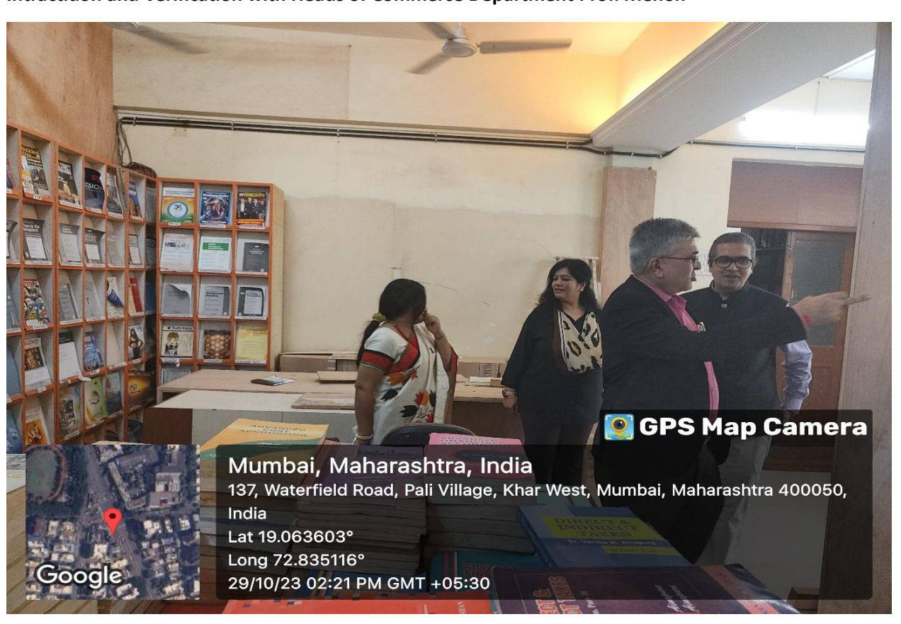
Visit to Library