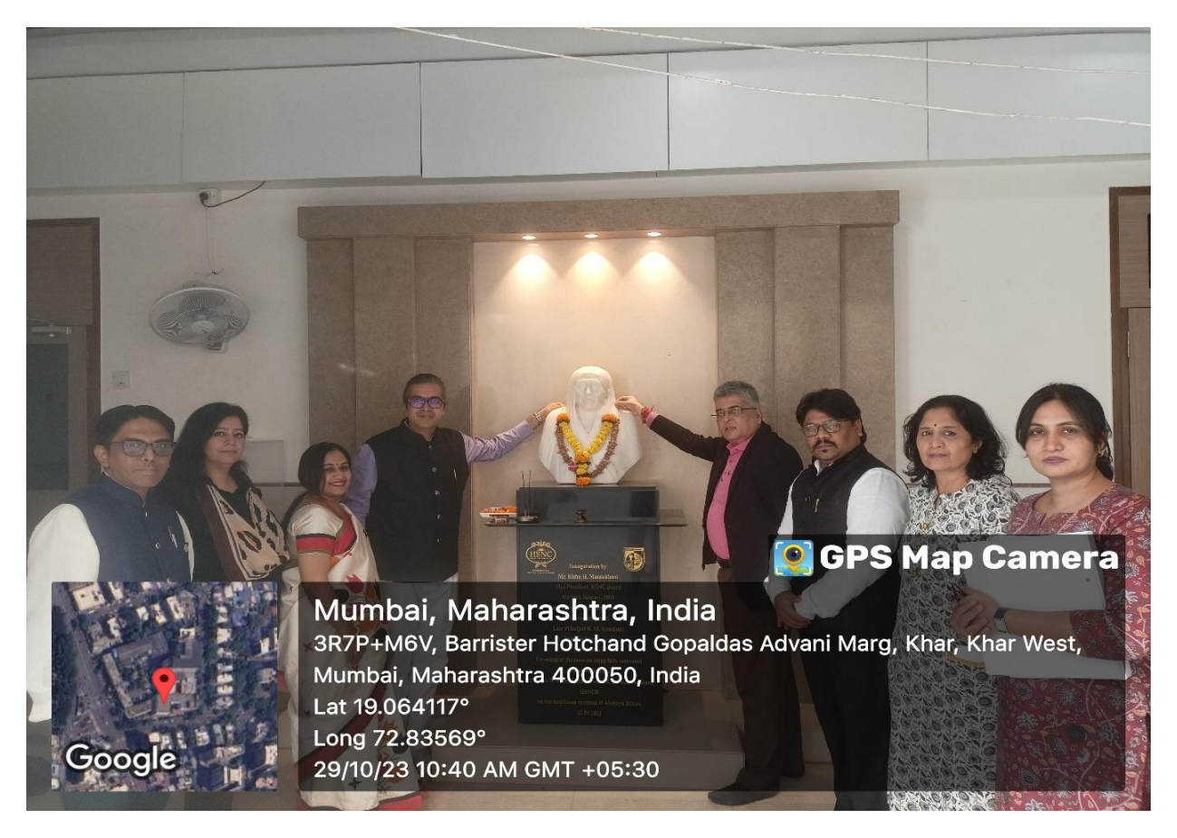
Blessings of Mother Mithibai