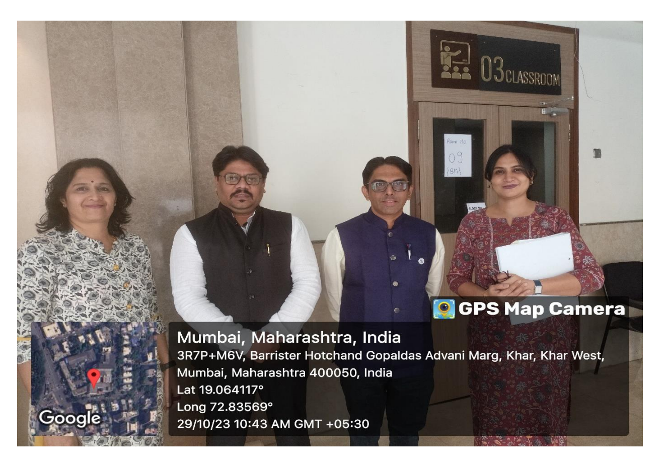
Team with NAAC Coordinator