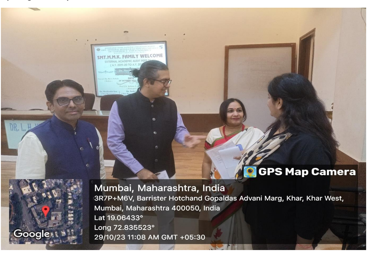
Discussions for the AAA work