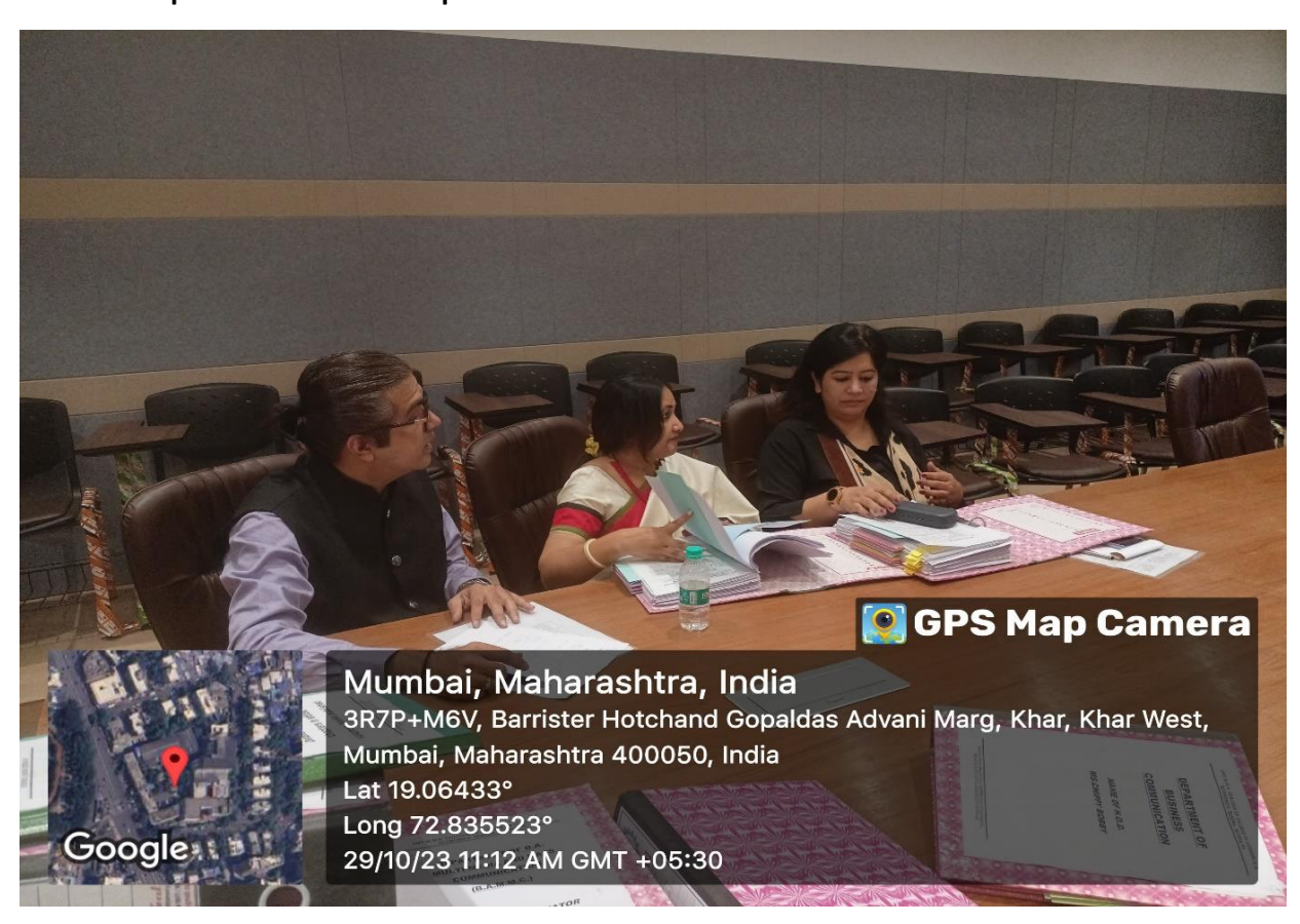
Preparation of Final AAA Repo