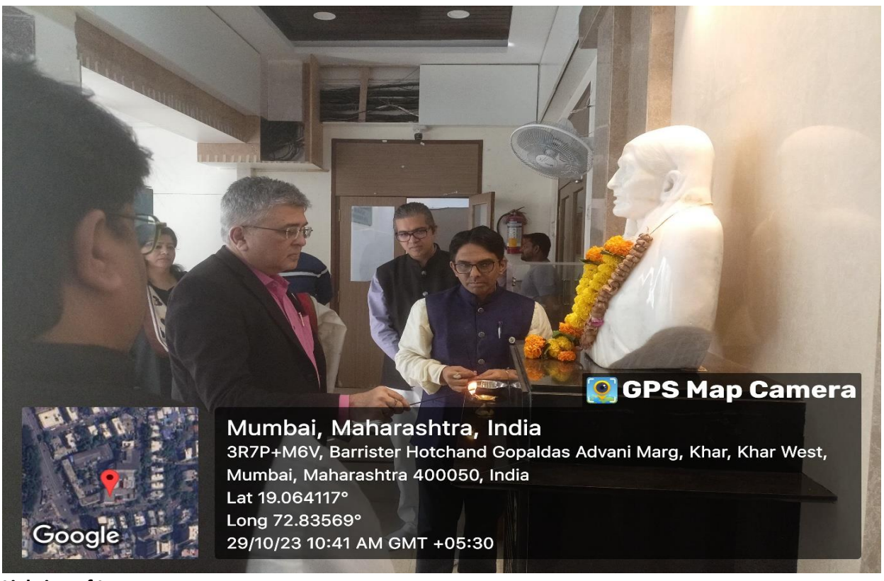
Lighting of Lamp