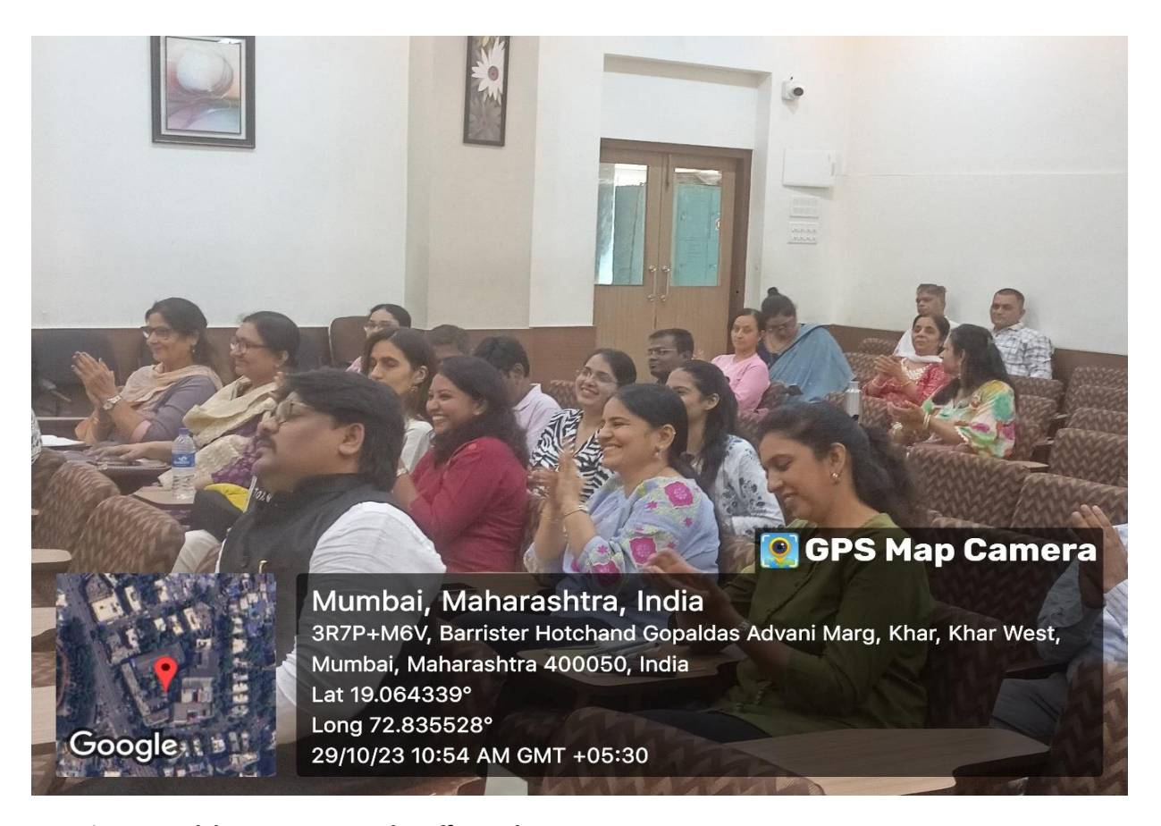
Opening remark by Convener and Staff members