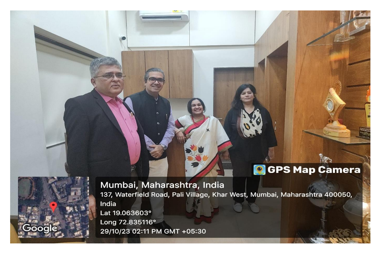
Visit to Research Centre and Departments