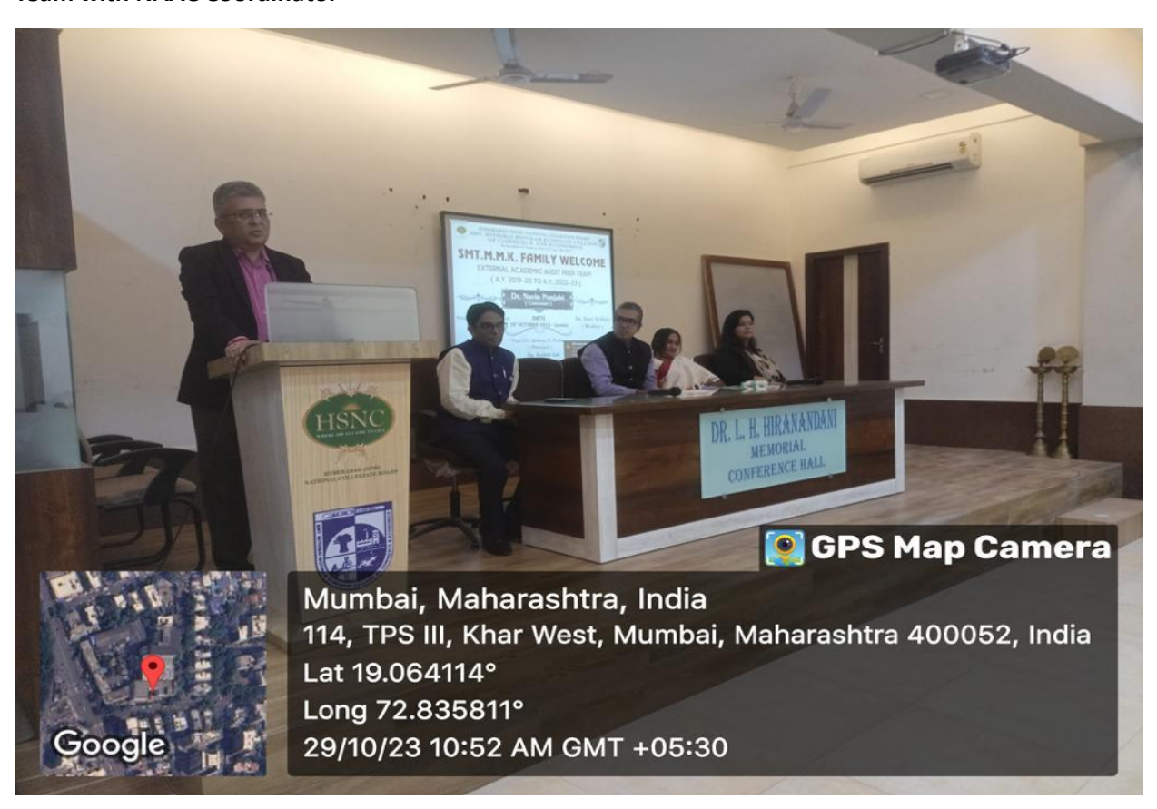
Principal Speech in Inaugural session