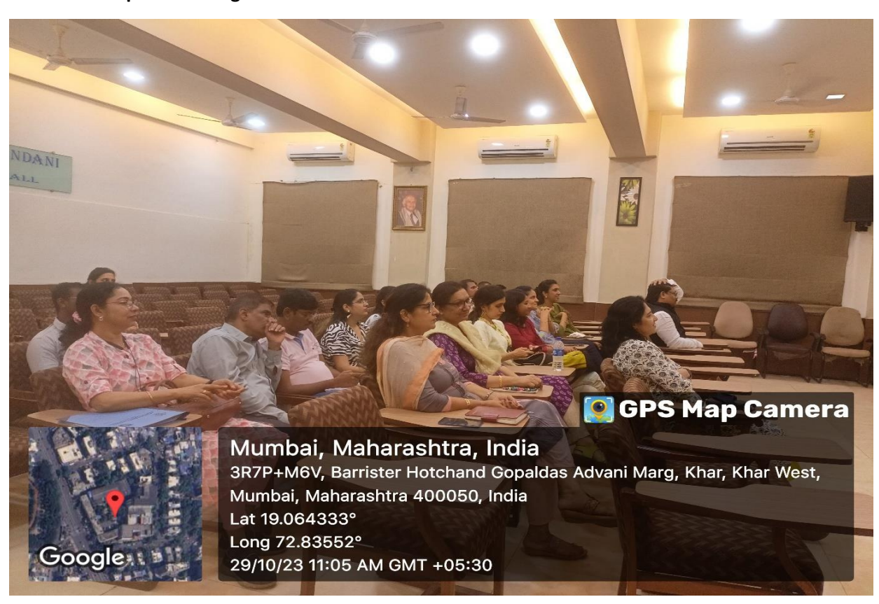
MMK Staff members