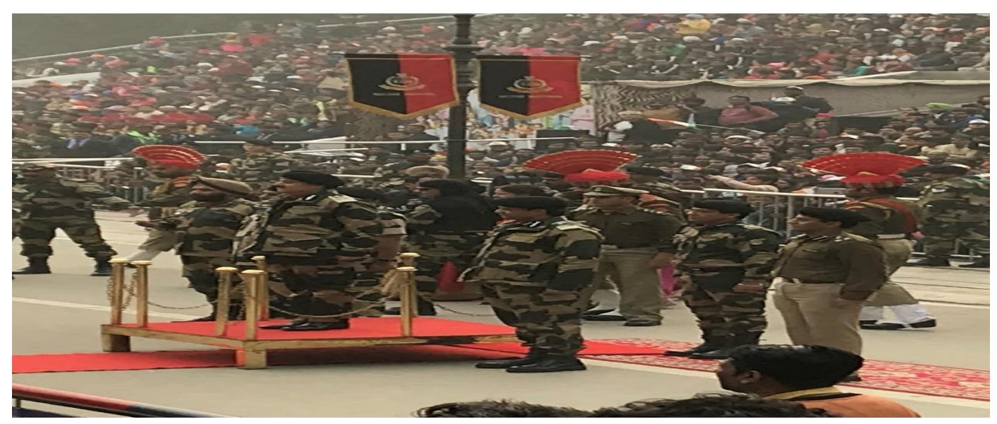
FLAG HOSTING AND REPUBLIC DAY PAREDE