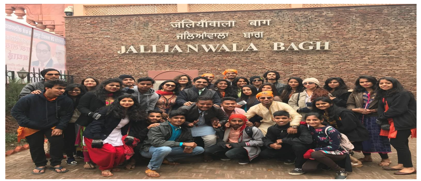
FEELING OF PETRIOTISM AT JALIANWALA BAUG