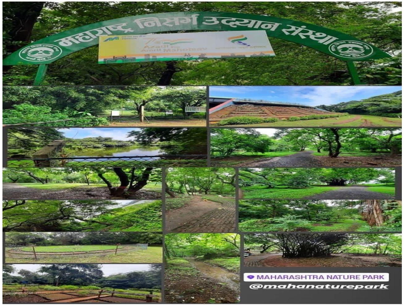
Colours' of mother Nature

Thus, in real sense it was Nature Camp Visit!!!