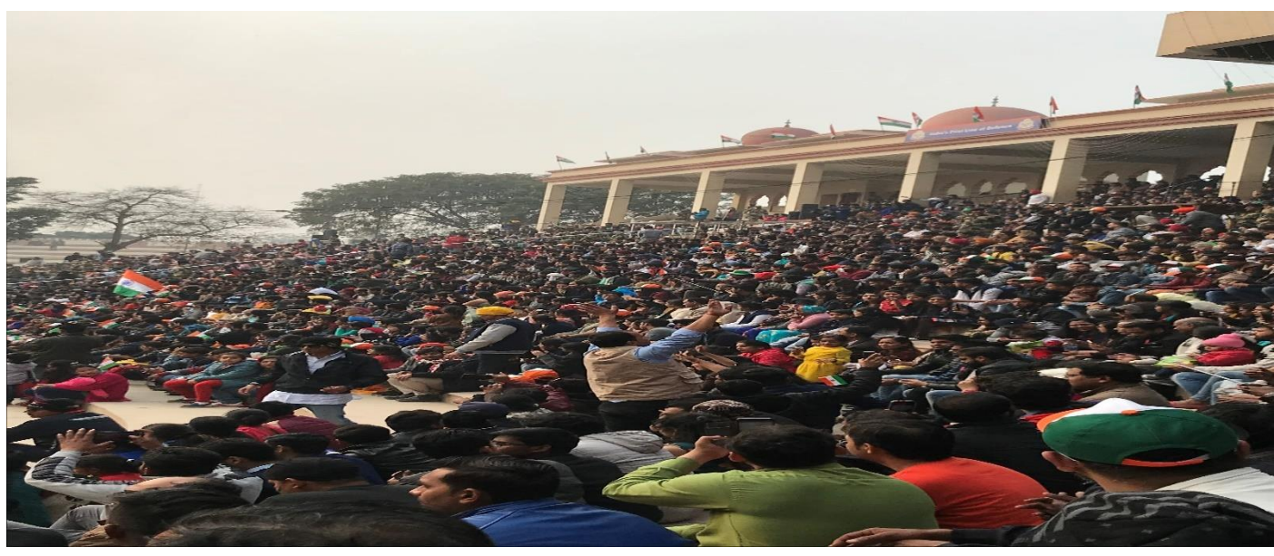
WAGHA BORDER 26-JANUARY CELEBRATION