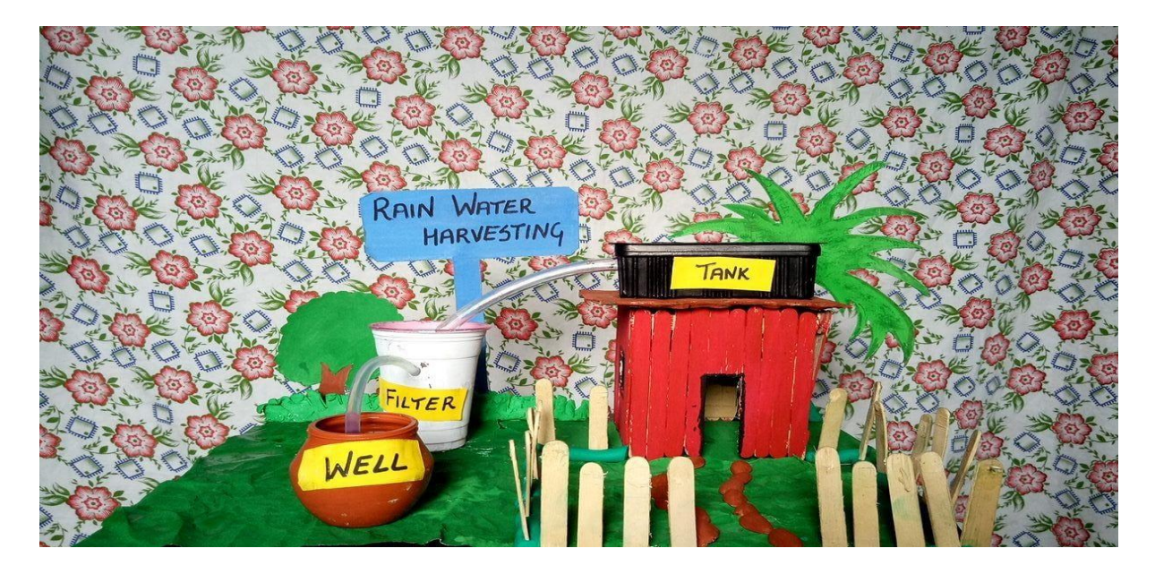
DR.AASHISH JANI PROFESSOR INCHARGE

Rain Water harvesting is the act of collecting rainwater. The rainwater is stored for various kinds of use and can be filled into the ground water apart from water tank and other means of storage. Rainwater Harvesting is less cost. Helps in reducing the water bill. Decreases the demand for water. Reduces the need for imported water. The driving forces for considering rainwater harvesting as an option are because of the rapid increase in human population across the globe, the growing need for desalination plants, <u>food security concerns</u> and the fast depleting freshwater resources. One of our classmate have made a model on it.