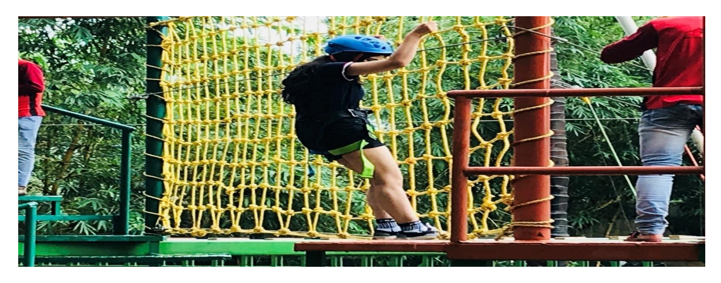
NATURE CLUB ADVENTURE GAMES