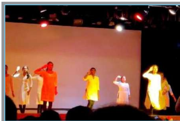
Independence Day celebration National College