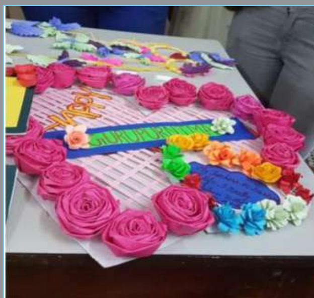
On the event of Guru Purnima students made beautiful wall hangings and paid respect to their Guru