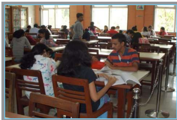
Library Reading Room