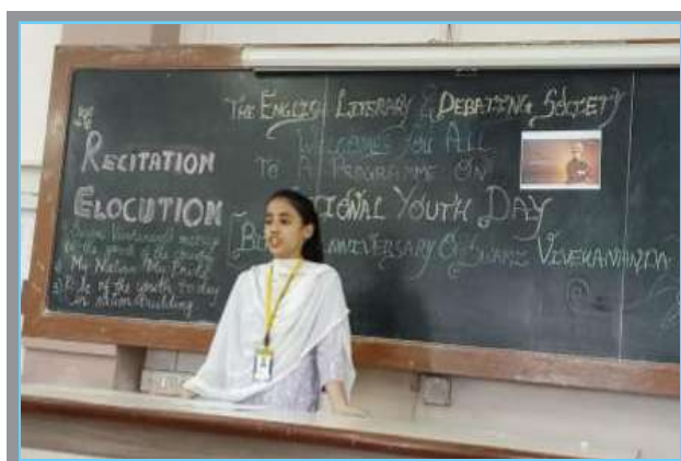
Celebration of National Youth Day Recitation, Elocution