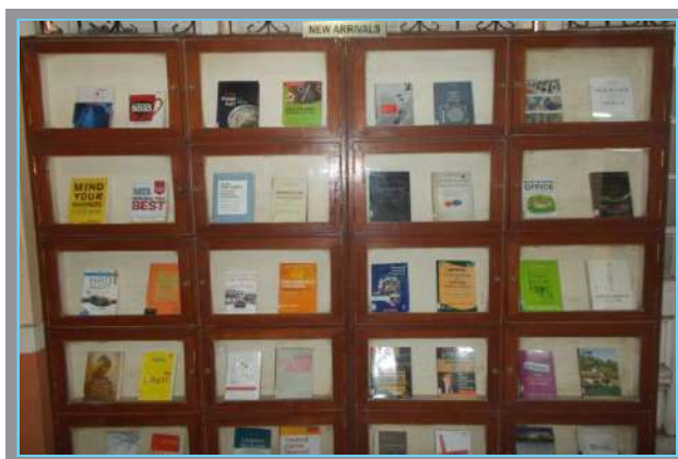
New Arrivals Display