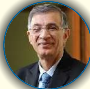
Shri Dr. CA Niranjan Hiranandani