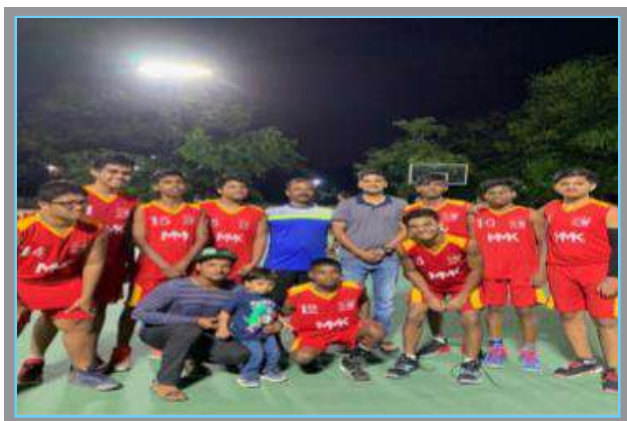
Junior College Basketball team were placed runners-up at DSO Basketball Championship 2019-2020.