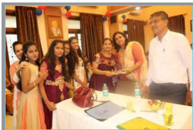
Hindi Kavya Pathan Pratiyogita