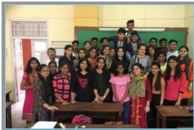
Hindi Patra Lekhan Pratiyogita