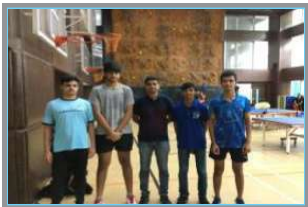
Junior College Table Tennis team Champions at DSO and were placed 3rd at divisional level 2019-2020.