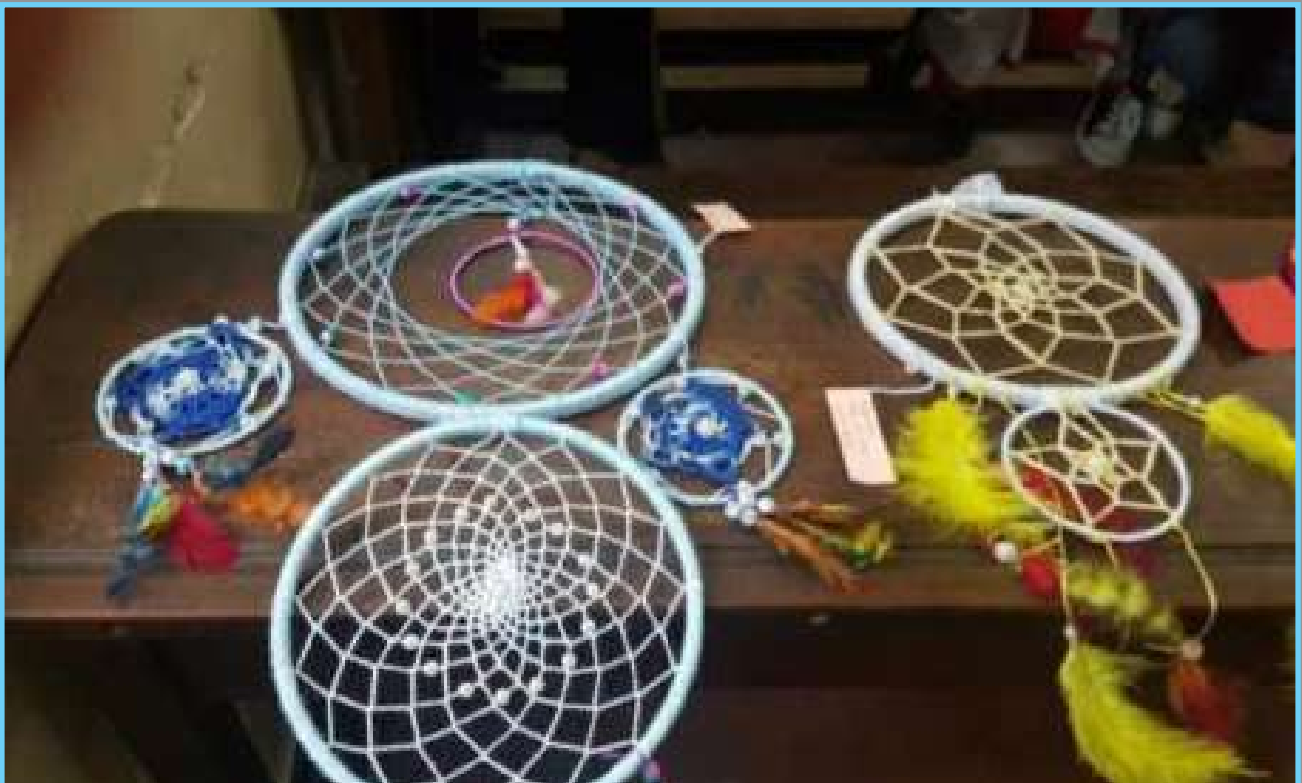
"Friends are forever" On Friends Day, students made Friendship cards, Friendship bands & Dream Catchers and evolved in their creativity and imagination