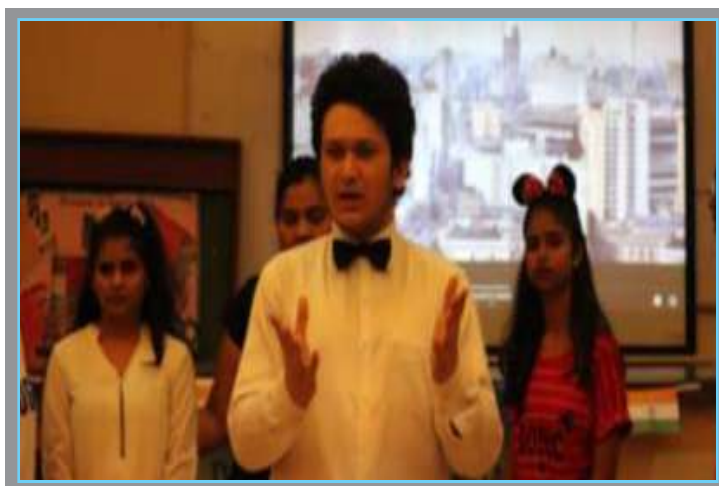
Students enacting the French Play "Le Jardin"

Every year the French Department celebrates the French National Day as "Bastille Day". Here are few glimpses of the celebrations