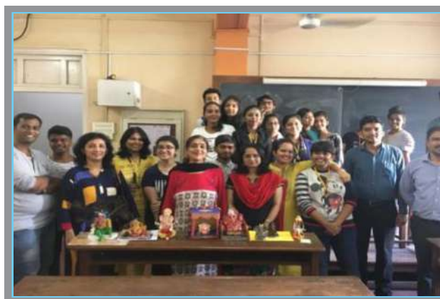
Fine Arts committee Explored art through various activities as “TRENDING CRAFTS”