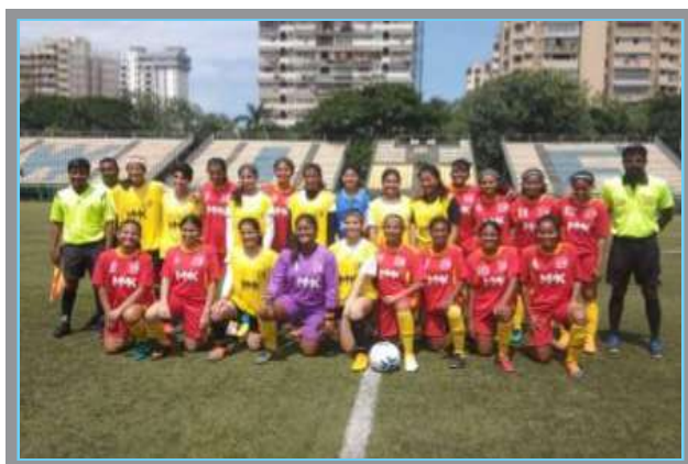
Smt. M.M.K College Women's team placed runners-up at Dr. L.H. Hiranadani memorial Football Tournament 2019-2020.