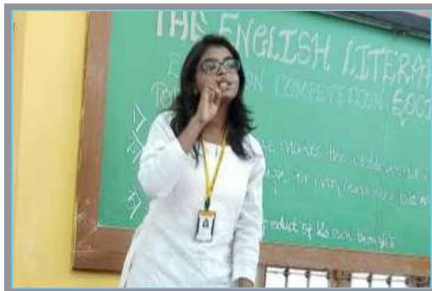
SYJC student expressing her view in an Elocution Competition