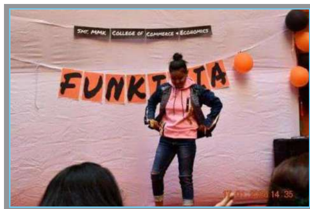
Performances of students in singing and dance competition