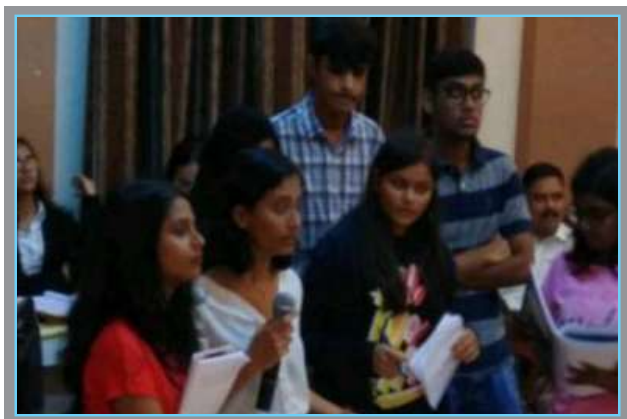
Students engaged in a heated debate on Competition is Necessary for Development