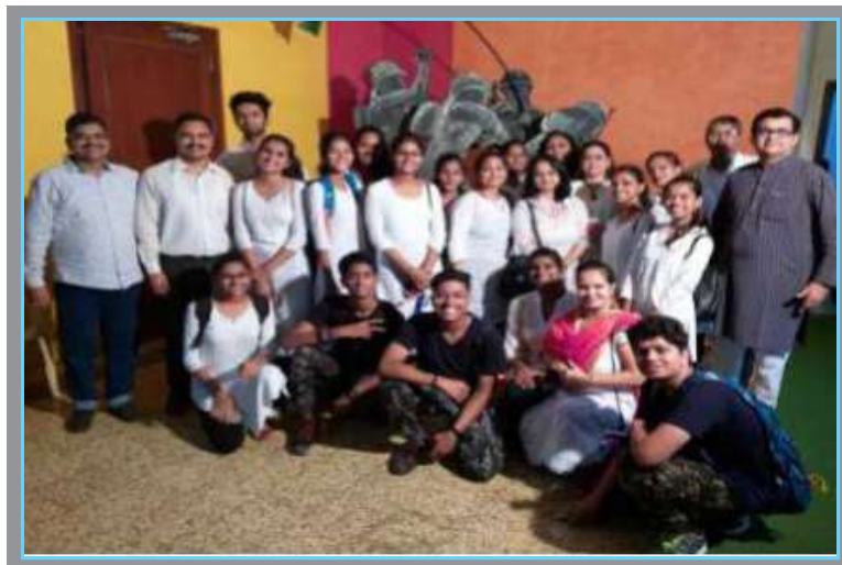
Students with a patriotic fervor on independence day

Cultural Committee enhances the inbuilt creativity of each student