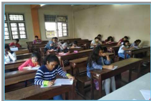
Penning down deep thoughts in an Essay Writing Competition