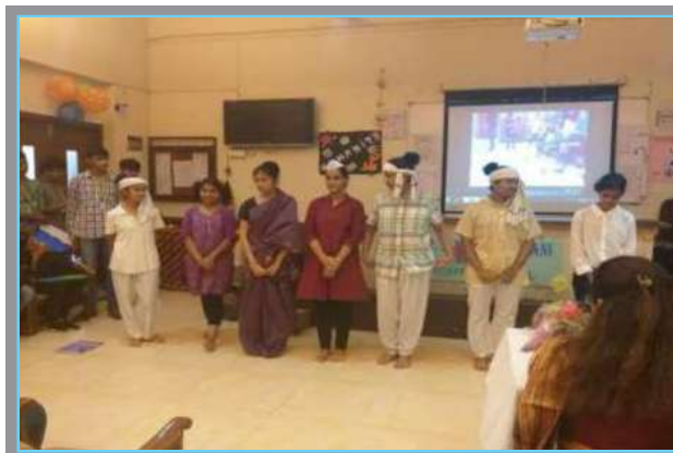
Students performance in SYJC Inter Class Drama Competition