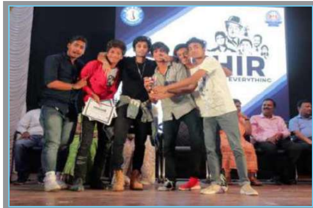
Students won "Best College Trophy" in Inter College Competition