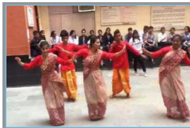
Folk Dances from various states performed by Junior College students