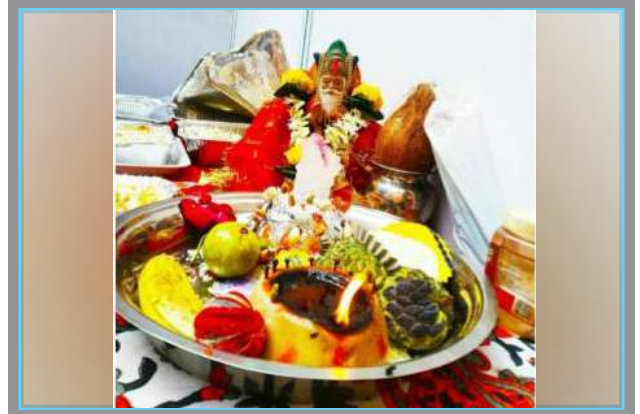
The flame of Sindhi culture lit through Sindhi food, tradition, dance and custom, jai julelal Behrana "Sindhi Festival" celebrated in college